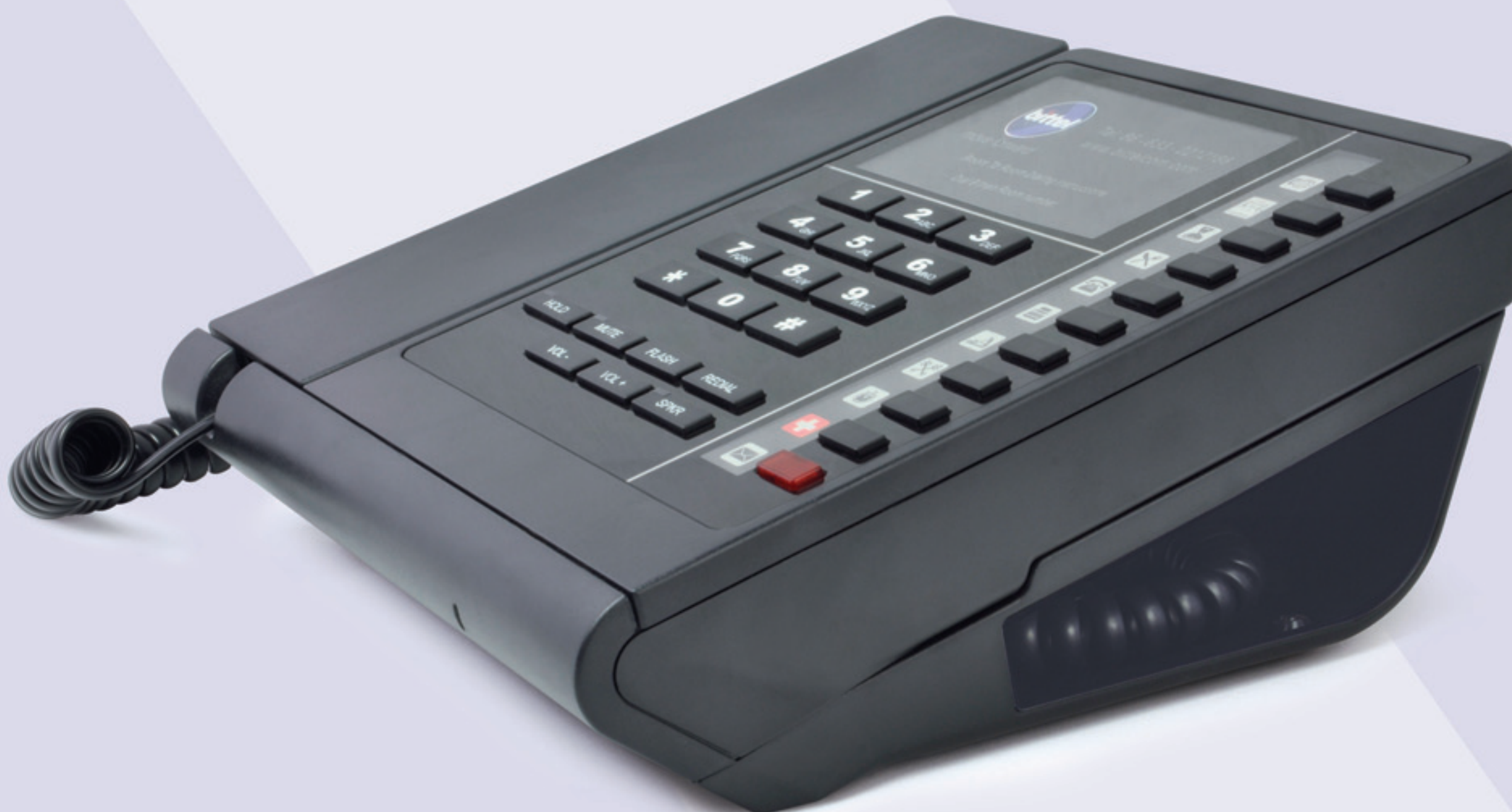
Model: HA9888(67)TSD-10S (LP)